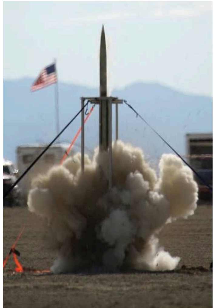
(Above) Aidan Sojourner and Alexis Thoeny load their 70K attempt, which was also one of their Level 3 certification flight. At right is the moment of ignition of the Aerotech M motor. A moment later (Below) is the motor catoing, damaging the launch tower and making a nice hole in the playa.